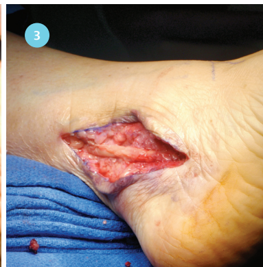
Figure 3. Final picture of tibial nerve wrapped with AlloWrap DS with monocryl sutures in place.

Post-operatively, the patient was non-weight bearing for two weeks, and the patient started physical therapy at three weeks. The patient had complete resolution of the paresthesias on her first post-operative visit, which continued through the most recent follow-up five months later. Subjectively, post-operative results using AlloWrap DS tissue were much improved as compared to the previous procedure.